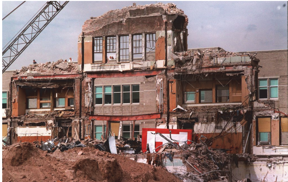
Figure 2-1 Demolition of unreinforced masonry construction at East High School, Salt Lake City in 1996.

In some cases, districts have decided to demolish and replace URM school buildings (Figure 2-1), whereas in other cases districts have opted to retrofit URM school buildings. Ogden High School is an Art Deco building constructed in 1937 and is listed on the National Register of Historic Places. It was retrofitted and expanded in December 2012 (Figure 2-2 and Figure 2-3).