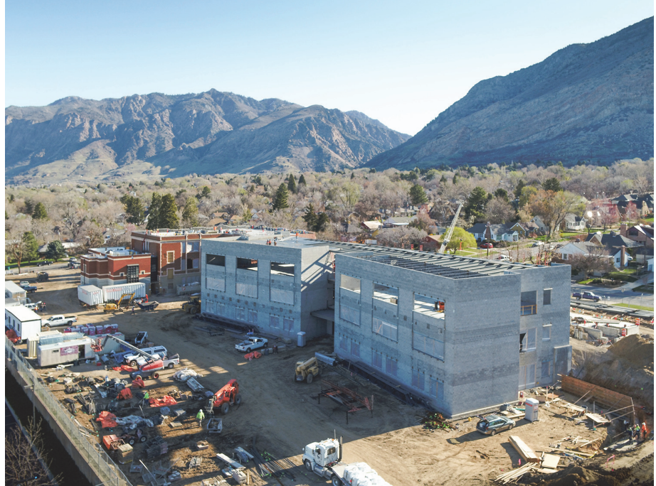
Figure 2-4 The new three-story addition currently under construction at Polk Elementary School in Ogden. In the background, work on the seismic retrofit of the original school building, from 1926, is underway (photo credit: FFKR Architects).